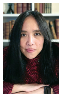
BY LIRA SIMON CABATBAT

The government’s plan is that all visa information will be available online after the 31 st of December 2024. Some, me included, have expressed scepticism about the practicality of this plan given the already difficult